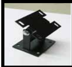
Steel Swing Bracket