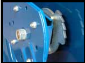
Two Stage Ratchet