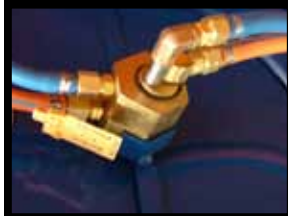
Solid Brass Connector Block