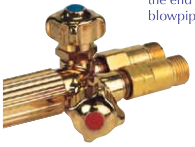
Shown attached to a handle