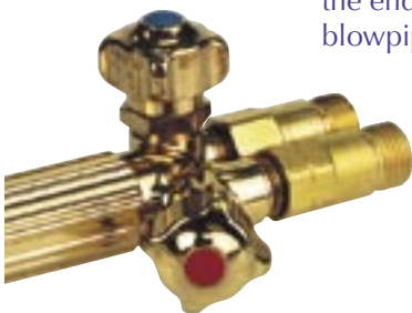
Shown attached to a handle

Flashguards screw onto the end of a handle/blowpipe/torch